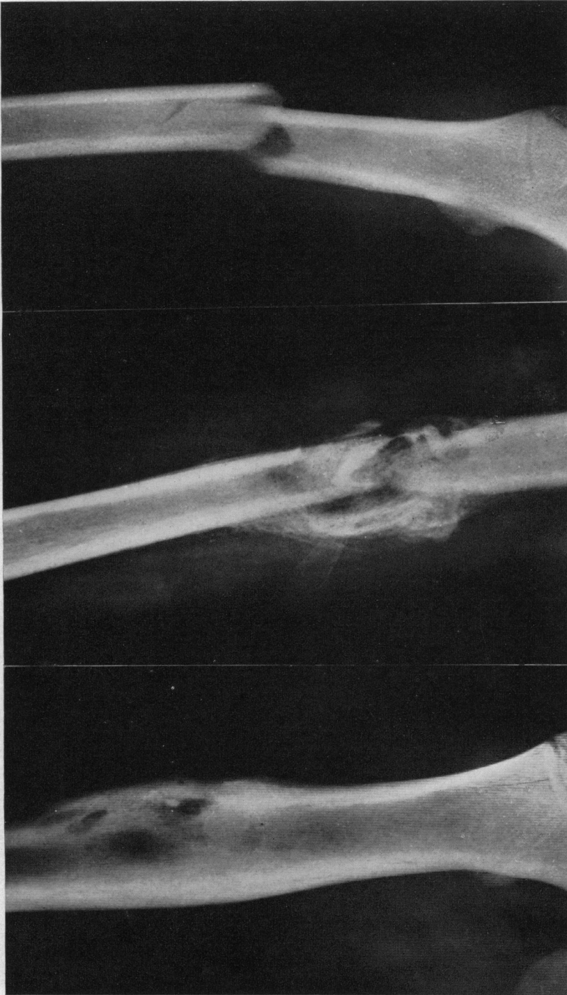
Fig. 1.—Röntgenogram at time of accident, showing oblique fracture at junction of middle and upper thirds of the left femur.